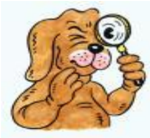
"Accountability" Glendale's Watchdog