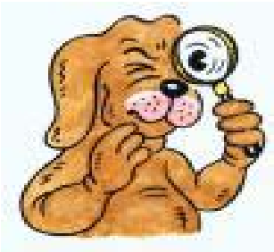
"Accountability" Glendale's Watchdog