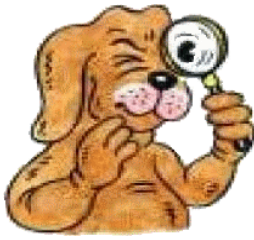
"Accountability" The Government Watchdog

IF YOU'RE NOT OUTRAGED YOU'RE NOT PAYING ATTENTION